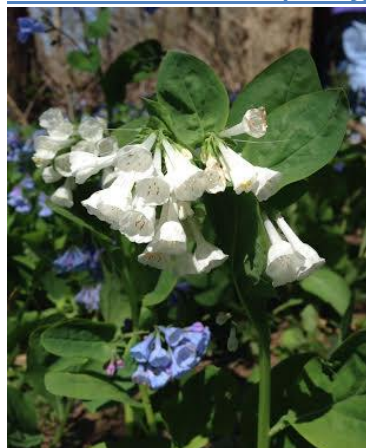
White (and blue) Bluebells