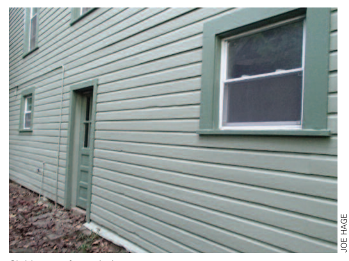
Clubhouse after painting

Big news, I finally finished painting the back of the clubhouse! It was a lot of scaping and sanding but I think we have a paint job that is going to last us for a while. It is so gratifying to see the clubhouse freshly painted, transformed from its former dilapidated self. Thanks to everyone that had to endure the irritating sound of the orbital sander running for hours. My next painting project will be the siding on the exterior of my living room. This addition to the original building was built relatively recently, in the 90s, so I think the prep is going to go a lot faster. Less sanding!