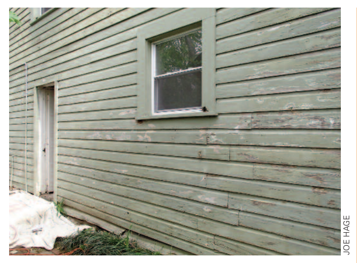
Clubhouse before painting