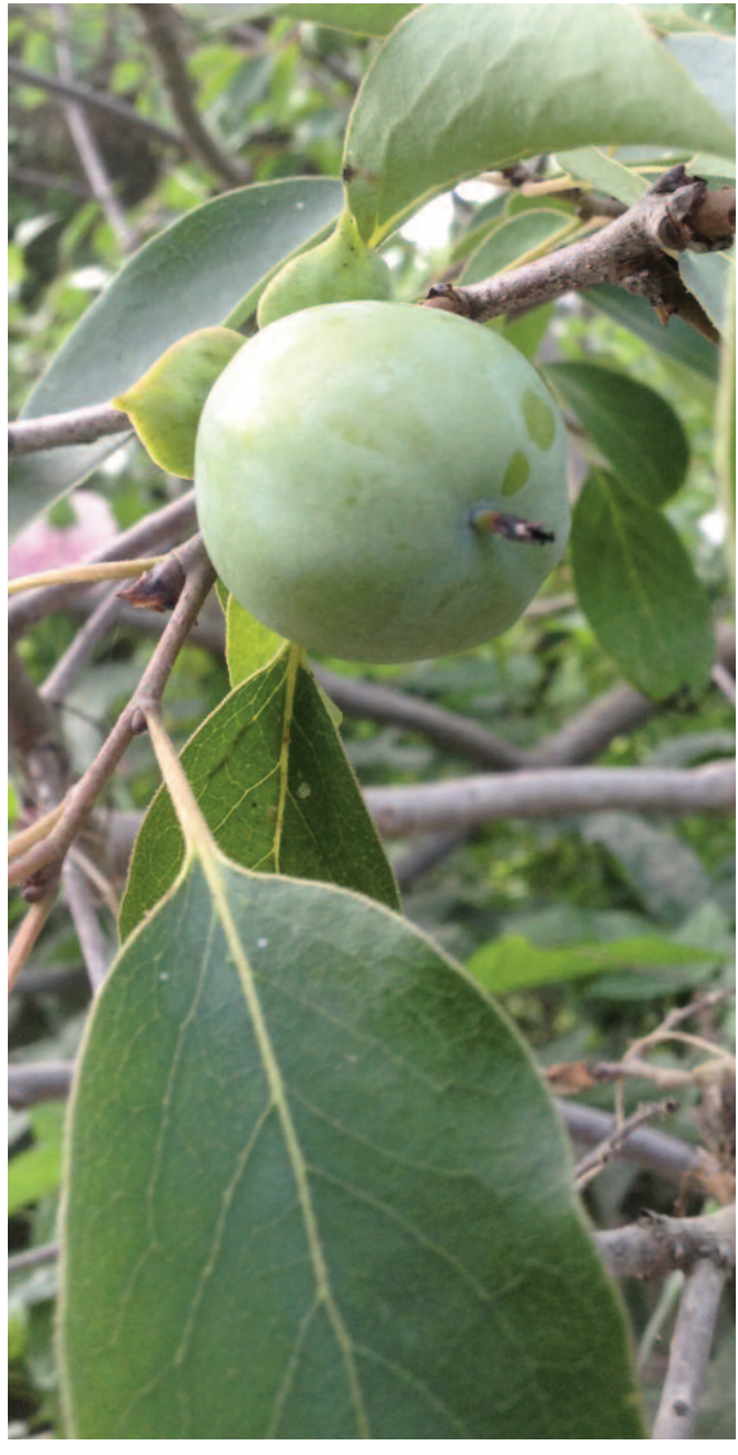
Persimmon Tree fruit