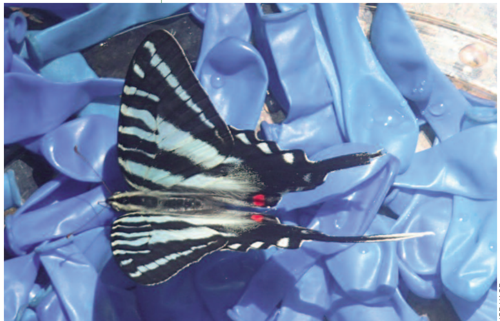
Zebra Swallowtail on blue balloons