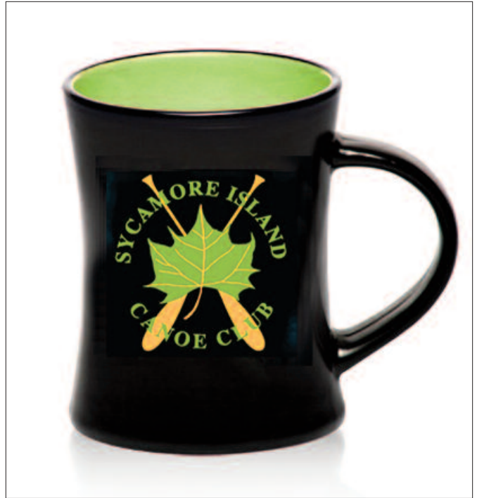
Sycamore Island mugs, available for $10