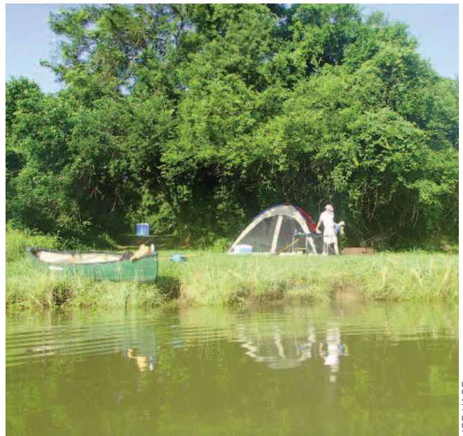
Campsite on Patuxent river

I got back from my long weekend and I found that I had a serious ant problem. We all get a few sugar ants in the kitchen at this time of year but when I saw them trailing across my living room I got concerned. On Wednesday as I was waiting for the roofer to show up I