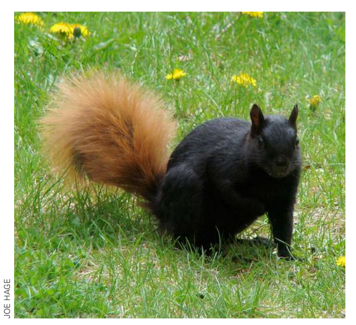
Black squirrel, organge tail.