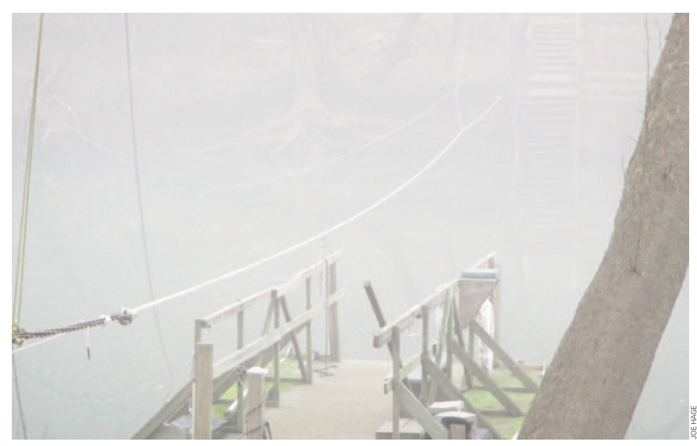
Shrouded in fog