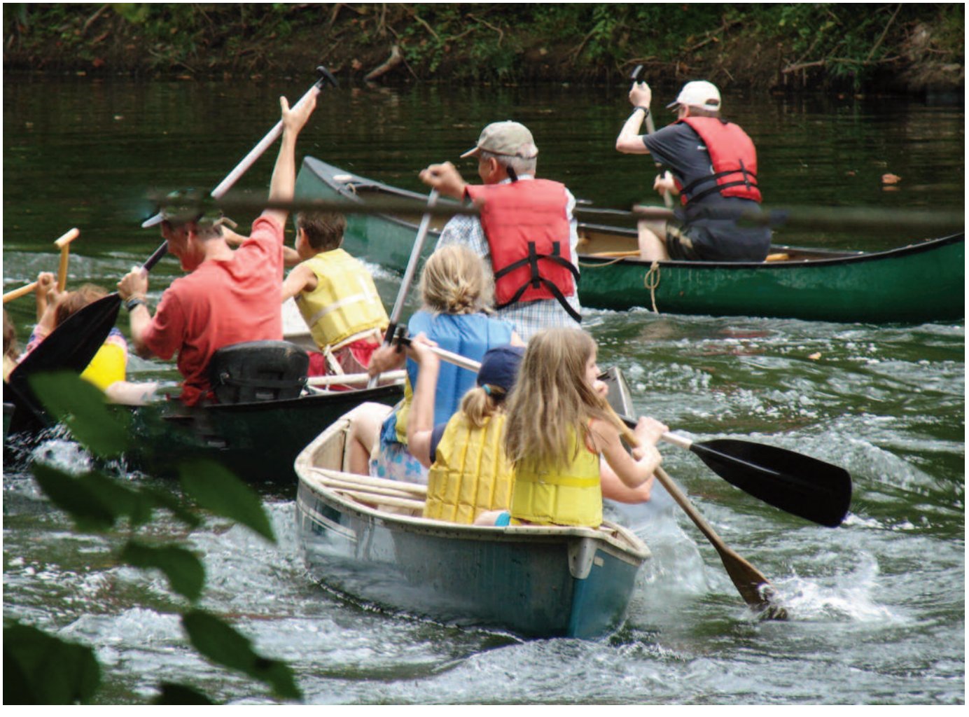
Canoe Race on Regatta Day