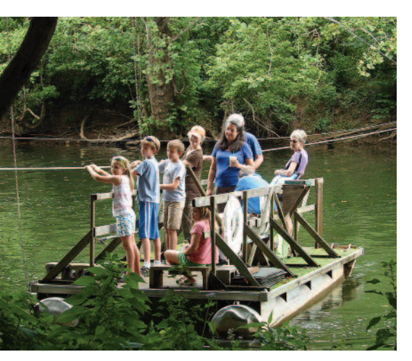
Ferrying over to the Island on Regatta Day