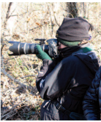
Birdwalk