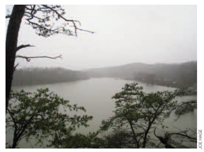
The view from the top of Offutt Island, looking upstream toward the Angler's put-in

heads and three of the duller females. Today, I saw a Yellow-bellied Sapsucker, female. It's a type of woodpecker that is more common to the north of us but it is often seen in these parts during winter.