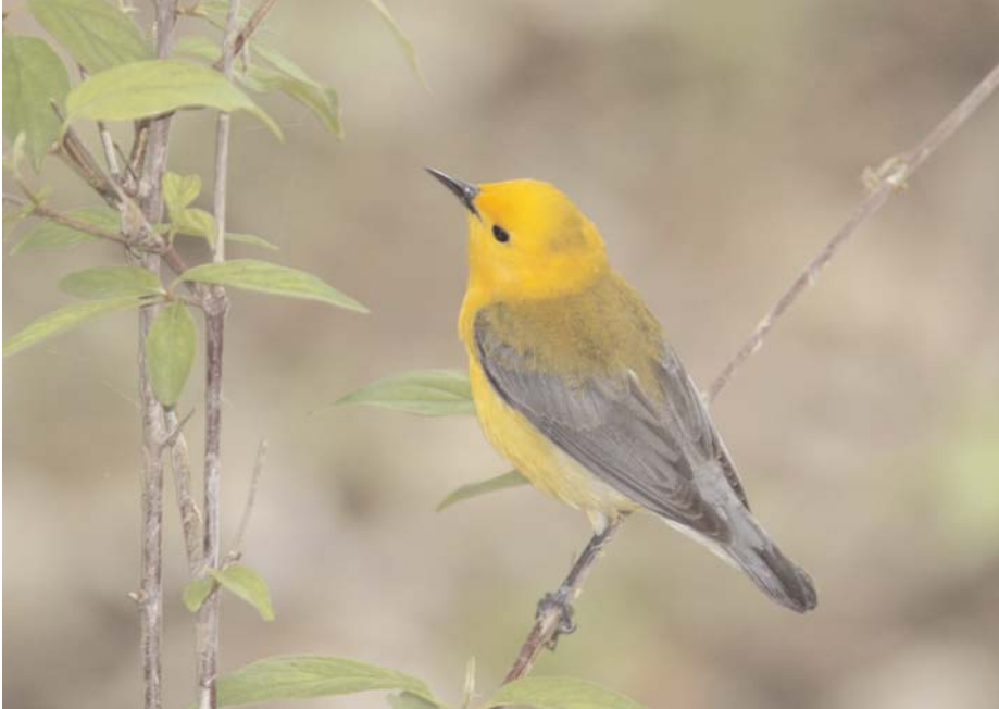
Prothonotary warbler, a breeding summer resident on the Island