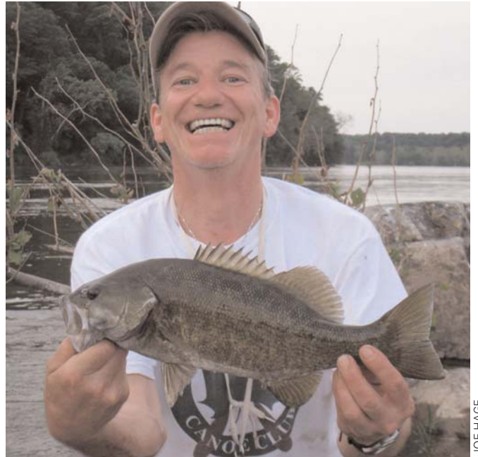
A nice smally (small-mouth bass)

I just had a good look at our young eagle. As far as I can tell we have just the one successful chick. It was