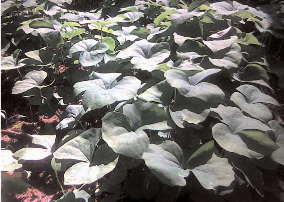
A bed of quite rare Twinleaf.