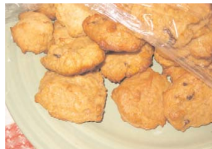
Workfest photos by Sue Super