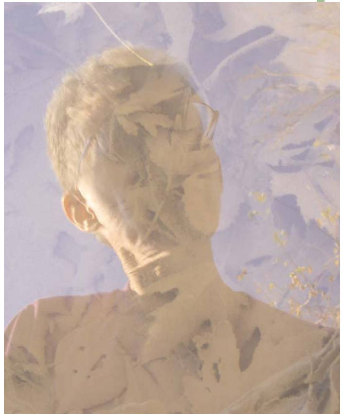
Self-portrait looking in the river

The early afternoon visitors left the Island. There was just me. Very nice. The whoosh of auto traffic from Maryland and Virginia is no longer muffled by leafy trees. The wind had subsided. Dry leaves scratching each other on the ground was the only natural sound.