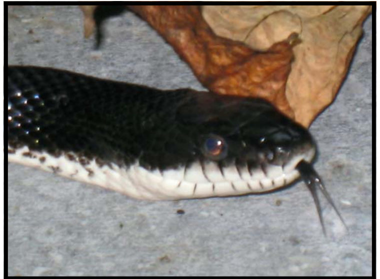
Black Snake, Photo by Joe Hage

Special Workday: Oct 4th. 9:30 See president's letter for de- tails.