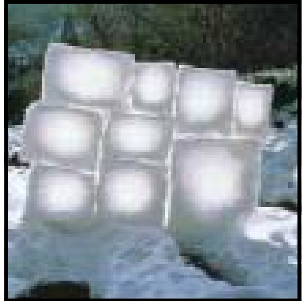
Ice Sculpture by Scottish artist, Andy Goldsworthy

See details of what to bring in the presidents letter.