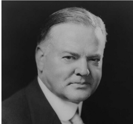
Hoover 53 Votes