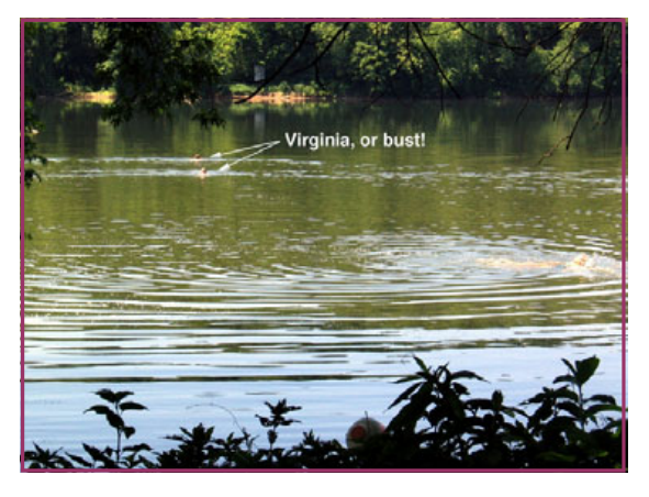
...swam all the way over to Virginia!