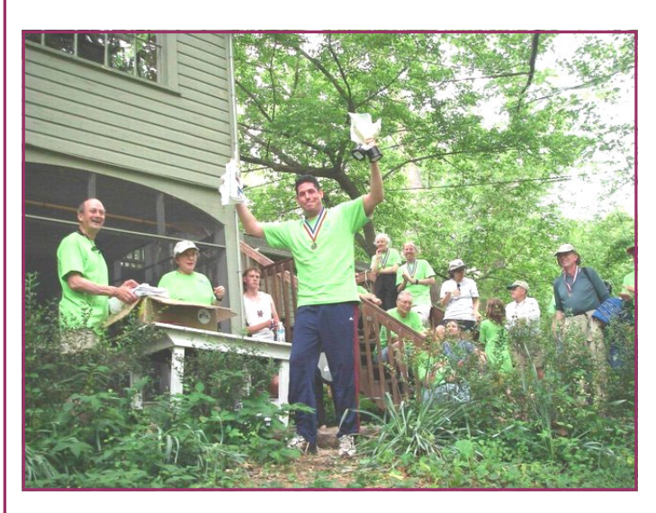
The Fastest Guy Down the River [p. 8]

N.B. General meetings are held at 8 p.m. on the second Wednesday of the month.