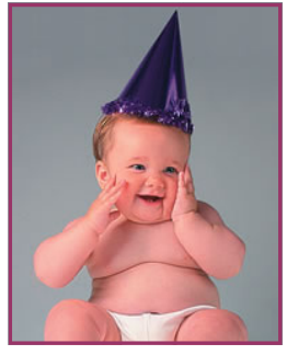
No, he's not!

The plumbing is back on in the clubhouse and the toilets are working in the ladies room once again. I found when I turned the water back on that I had to replace a fill-tank valve in one toilet and I had to replace the feed line to the ladies room sink. A large branch fell and hit the phone line to the house. It didn't break the cable but pulled the wood siding from the house where the cable was attached. I think I can nail it back in. The Workfest is coming up soon. I want to try and paint the exterior of the clubhouse along with some other fun projects. Call me if you want to help get things ready for that big day. By the way the April 1 Workfest is on my birthday. No fooling, again.