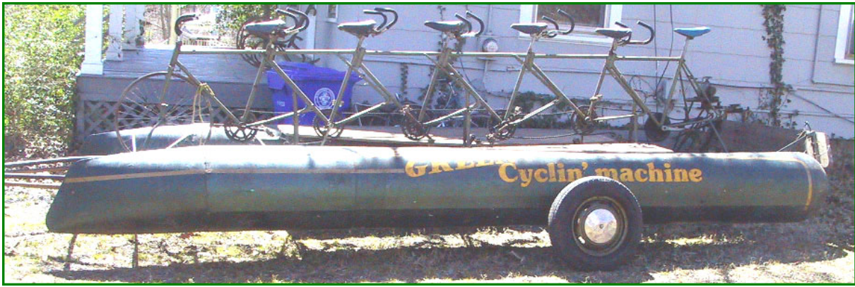
NEW! The Sycamore Multimodal