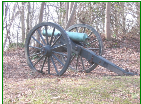
Cannon at Fort Marcy

N.B. Monthly meetings are held on the second Wednesday of the month.