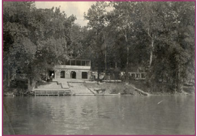
The "canoe house and runway" with canoe racks on both sides. "On the right side of the sleeping porch, the ladies' side, that's where I listened for the katydids."