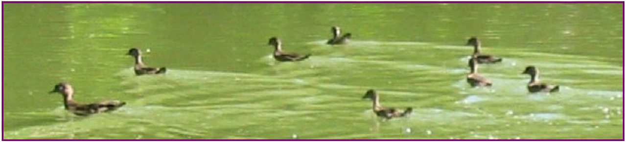
Make Waves For Ducklings