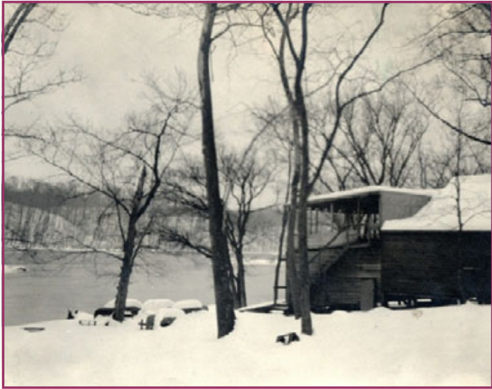
Snowy view of the porch across the front upstairs