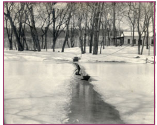
This would seem to be today's route of the ferry, remembered by her as "the float"—and seen across the way, she refers to Lovers Lane on the Virginia side