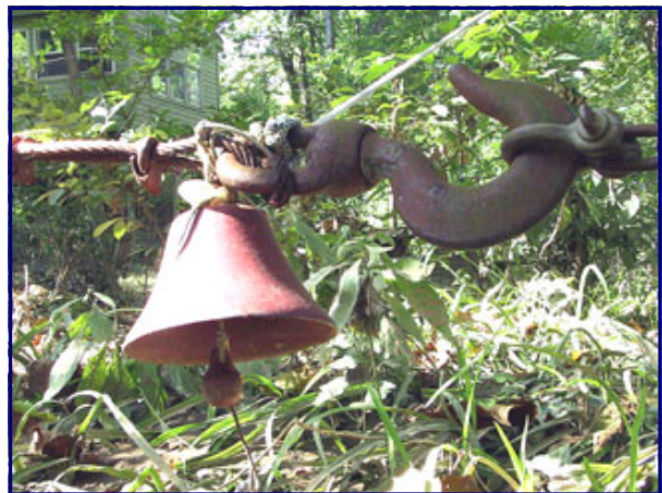
The Bell Tolls