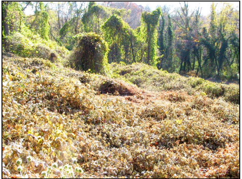
Results of Roundup application last year—treated kudzu below MacArthur Boulevard succumbed to the spray.

the cuttings and re-spraying that were needed to follow up were not done then because no successors were found to organize the projects when Phil and John were not able to continue.