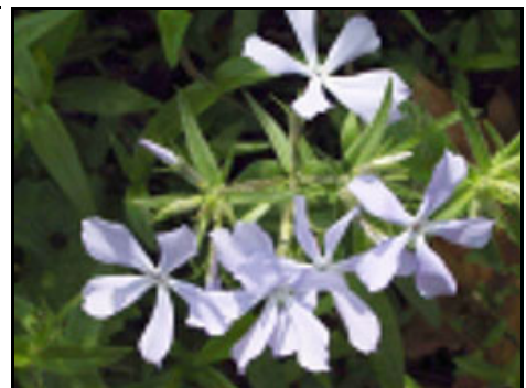
From left to right: Trout Lily, Golden Ragwort, Blue Phlox. Photos from Sycamore Island Spring '02.