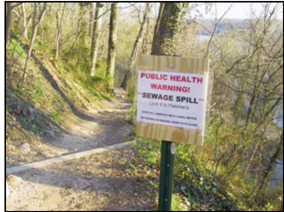
The Park Service has placed warning signs along the canal and here at the beginning of the path down to Sycamore Island.

park, Diane Ingram, and she confirmed my suspicions. The evidence of where the overflow occurred can be seen just below lock 7 at a manhole cover there. The canal between lock 8 and