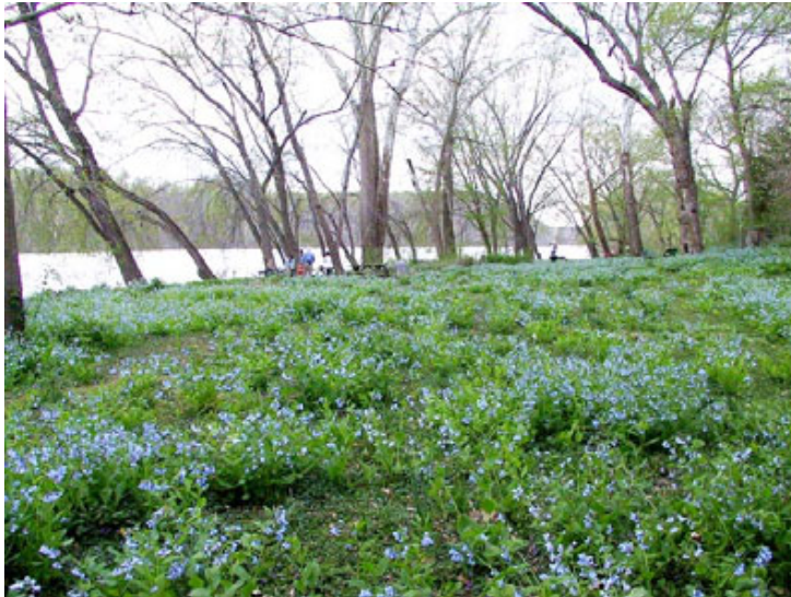
The Island's "lawn" is covered by Blue Bells at this time of year.

shrubs. Our leaders will seek out a giant, rare Shumard Oak, and will also look for the uncommon Chinquapin Oaks along the way. RG and John expect to show us the rare White Trout Lily, Wild Blue Phlox, Golden Ragwort, Virginia Blue Bells, and other herbs, flowering and not. They will identify our common and magnificent floodplain trees, including Silver Maple, Box Elder, Hackberry, Black Walnut, and Sycamore, and some of the typical floodplain plants such as Spring Beauty and Yellow Trout Lily.