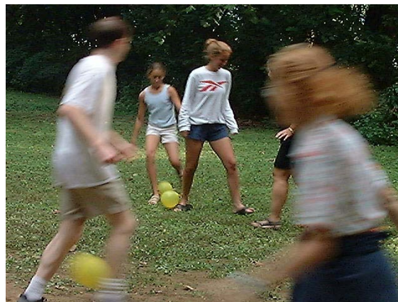
The Balloon Stomp is an action-packed event.

Not all contests took place on the river. Landlubbers also had a chance to test their mettle in feats