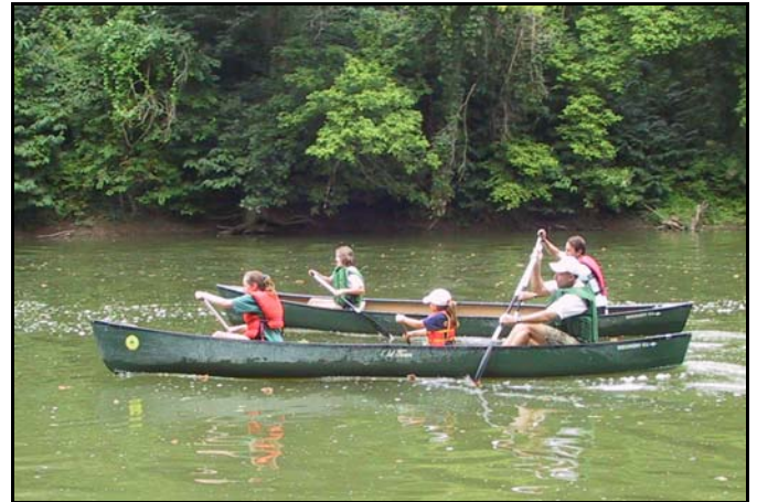
Not the winners, but running a close second in the 'Round-the-Island Race. This is a tough competition.