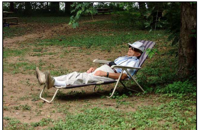
Tension builds for the Canoe Race in Regatta 2001.